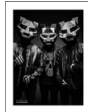
BLACK TIGER SEX MACHINE