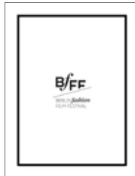
BERLIN FASHION FILM FESTIVAL